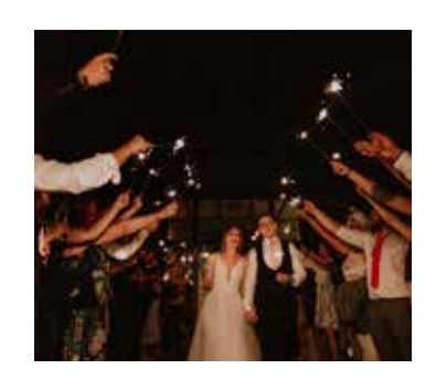
Midnight Your music comes to an end – time to retreat to your Honeymoon Suite.