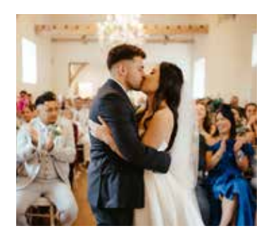
2 PM It's time for your ceremony in your choice of location.