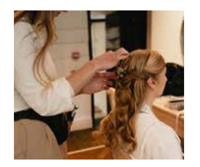
10 AM You and your wedding party begin getting ready in the Preparation Room.