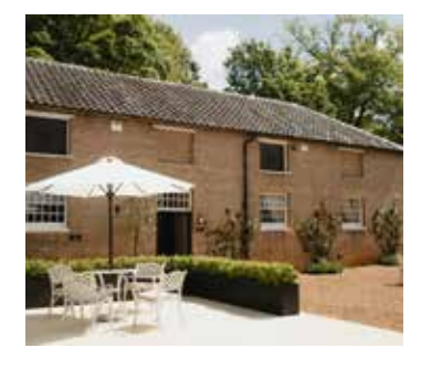
3 PM You can check into your honeymoon suite!