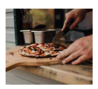
9 PM Party the night away with your guests and enjoy a choice of evening food.