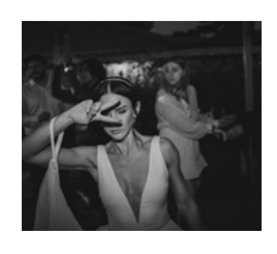
7:30 PM Your moment as a newlywed couple to cut the cake and have your first dance.